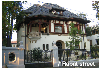
7 Rabat street