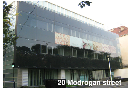
20 Modrogan street