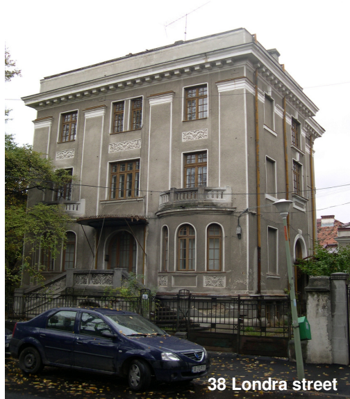
38 Londra street