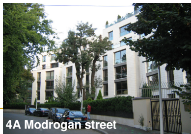
4A Modrogan street