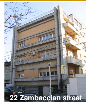
22 Zambaccian street