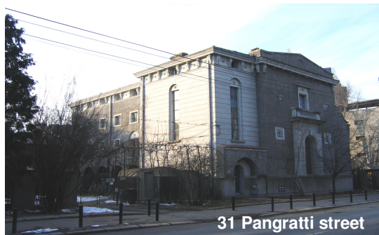
31 Pangratti street