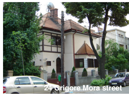
24 Grigore Mora street