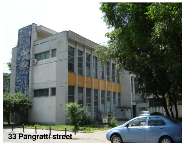
33 Pangratti street