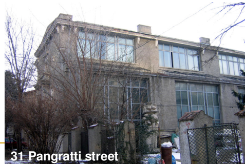
31 Pangratti street