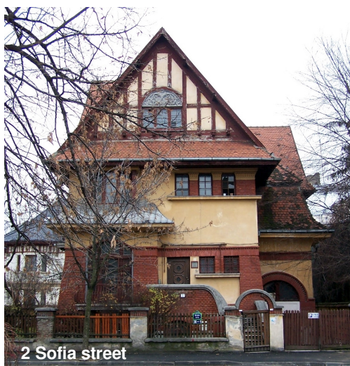
2 Sofia street