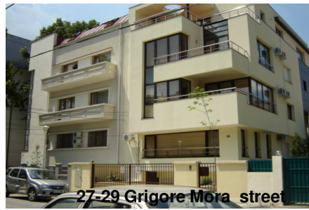
27-29 Grigore Mora street