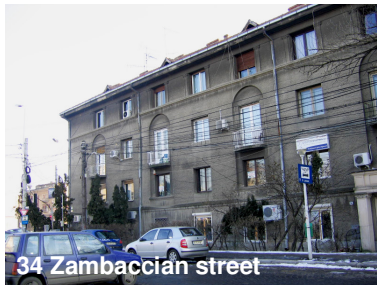
34 Zambaccian street