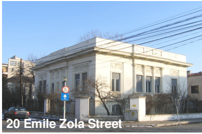
20 Emile Zola Street