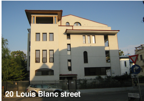
20 Louis Blanc street