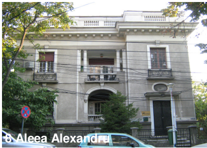
6 Alleea Alexandru