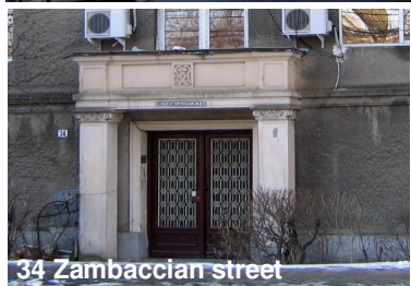
34 Zambaccian street