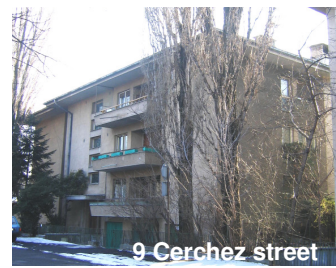
9 Cerchez street